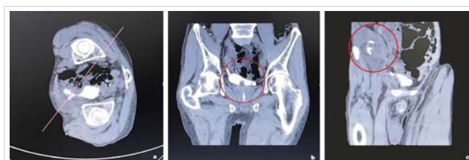
Figure 5: (a) The patient was positioned in a right lateral posture subsequent to the introduction of the contrast agent into the bladder. (b)(c) A notable reduction in the concentration of the contrast agent was observed in both the bladder and renal pelvis exhibited a significant decrease (indicated by the red circle).