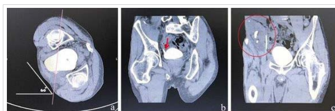
Figure 4: (a) Position the patient in a prone position, with a 60-degree inclination on the lower right side and upper left side. (b) The UVJ is clearly evident. (c) Retrograde flow of the contrast agent into the transplanted kidney. (Indicated by the red circle).