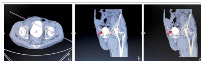
Figure 2: (a) A reconstructed coronal plane image was obtained at the UVJ following contrast injection. (b)(c) The stricture of the UVJ is clearly observable.

The bladder is fully filled with a retrograde contrast agent infusion, extending through the ureteral stent and